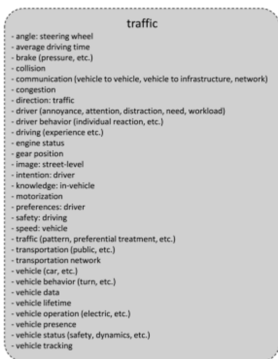
Fig. 2. Domain-specific context cluster for the traffic domain

that we have identified do not represent context within the respective domains exhaustively; they constitute just excerpts of the domains as discussed in the analyzed papers. Second, despite being careful about establishing intersubjective validity when consolidating the context elements (see Section 3.3), different approaches of consolidating could lead to a different categorization. Still, as the high-level context categories (generic and domain-specific context as well as social, technology and physical context) remained stable throughout our analysis, we do not expect that different approaches to consolidation on lower context levels would considerably change our results.