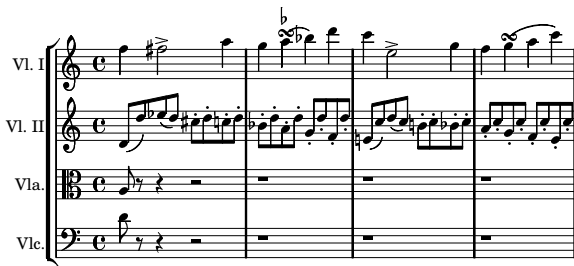
Figure 3: The string quartet, measures 105-108

in the first violin is playing fewer different notes, but has a more varied rhythm. We took a closer look at this passage. Setting the window size to 2 seconds, the measures H_D , H_{CID} , and H_{C,D} recognise the upper voice as melody whereas H_C , H_I , and H_{I,D} suggest the lower. The measures based on intervals are naturally led astray in this case, and the measure based solely on pitch class is also.