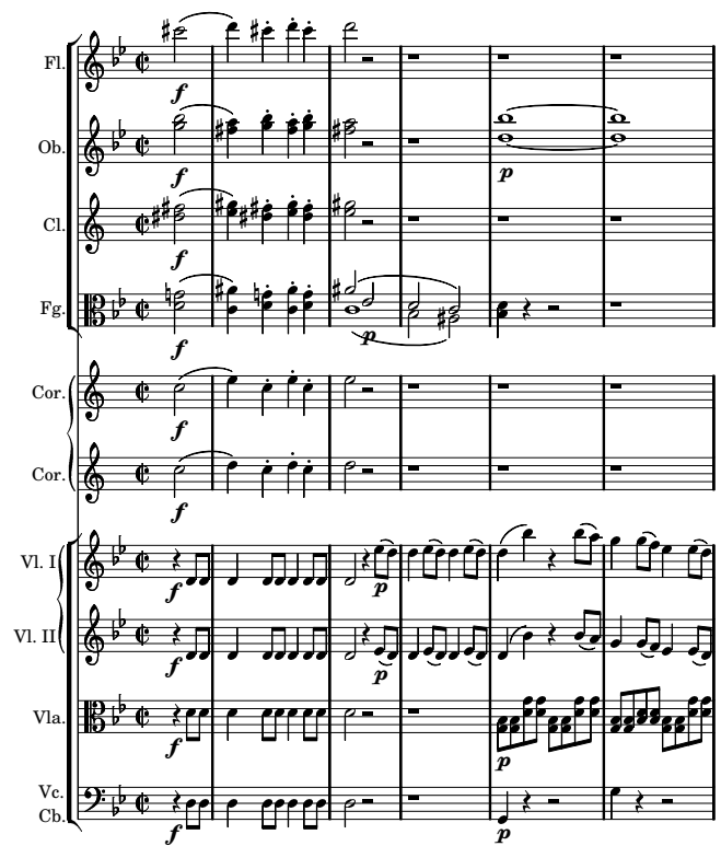
Figure 4: The symphony, measures 17-22

In the more complex Mozart piece, however, we witness that the highest note prediction strategy was outperformed by most of our methods. In the symphony movement the melody is not on top as often. Also, the melody role is taken by different instruments at different times. Figure 4 shows 6 bars (bar 17-22) from the symphony. In the first three, the flute (top voice) was annotated to be the melody, but the melody then moves to the first violin in bar 19. In bar 21 the first oboe enters on a high-pitched long note – above the melody. Such high-pitched non-melodic notes (doubling chord tones) occur frequently in the movement. The H_{C,D} measure cor-